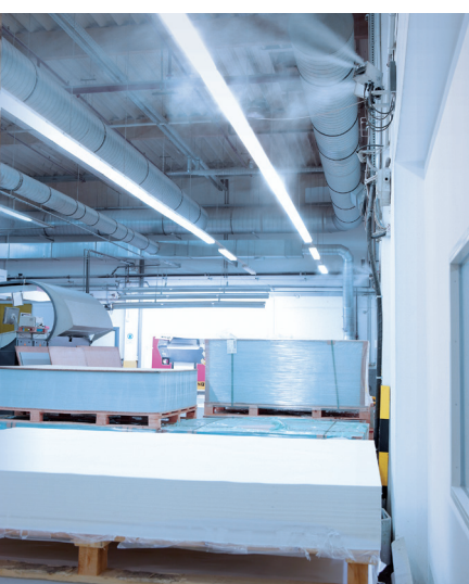
Humidification ensures trouble-free processing of the paper

If the air humidity in the paper storeroom or print shop is too low, the material releases moisture into the air. This leads to unwanted changes in the dimensions of the paper. The paper then is no longer perfectly flat and cannot be processed efficiently. Doubling, register differences, wrinkling and distortion are difficulties frequently encountered as a result of low humidity. Only paper processed at optimum humidity can be printed and finished without difficulty.