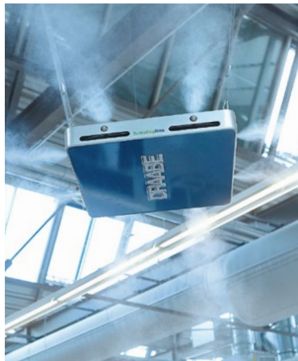
DRAABE TurboFogNeo 8: economical and hygienic