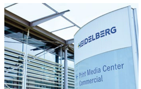
Print Media Center Commercial at Wiesloch-Walldorf

Just how important optimum humidity is for performance and a trouble-free printing process has again been proved by the DRAABE humidification system since 2015.