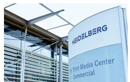
Print Media Center Commercial at Wiesloch-Walldorf

Just how important optimum humidity is for performance and a trouble-free printing process has again been proved by the DRAABE humidification system since 2015.